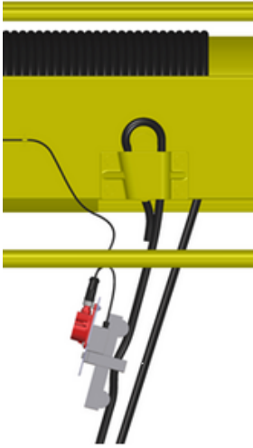
A. clamp on load cell

DETECT AND PREVENT HOIST OVERLOAD AND SIDE PULL CONDITIONS WITH ONE UNIT